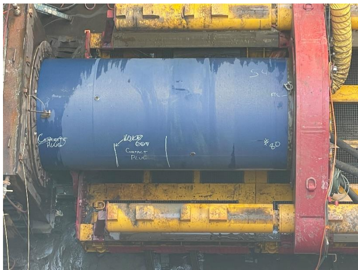
Last pipe being pushed in